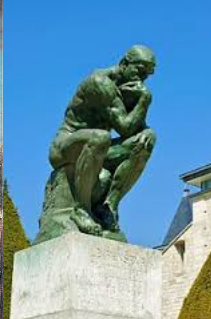
Rodin's Thinker 1902