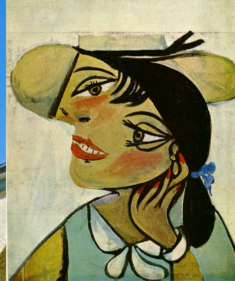
Picasso's Portrait de Femme 1937