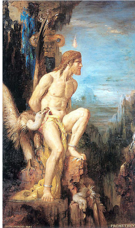
Gustave Moreau's Prometheus 1868