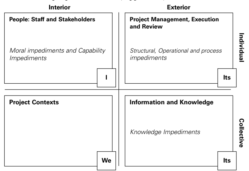
Figure Three: An Integral overview

Mapping both the tensions and impediments using a four quadrant approach as shown in Figure Three suggests the impediments are located mainly in the Upper Left and Upper Right quadrants – the individual interior and exterior areas. This highlights the need to pay attention to the people involved, their values and attitudes, the knowledge and thinking capacities they hold, the way in which people interact and the roles they play in foresight work. Recent evaluation work has begun to recognise these issues<sup>26</sup>, although the focus remains on how people affect the processes involved in foresight work (Upper Right), rather than on exploring the experiences, motivations and worldviews of the people themselves (Upper Left).